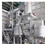
PulsReg®-Zentral Pulsed regenerative burner system