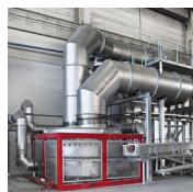
EcoReg® Rotary bed regenerator