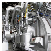
PulsReg® Regenerator burner